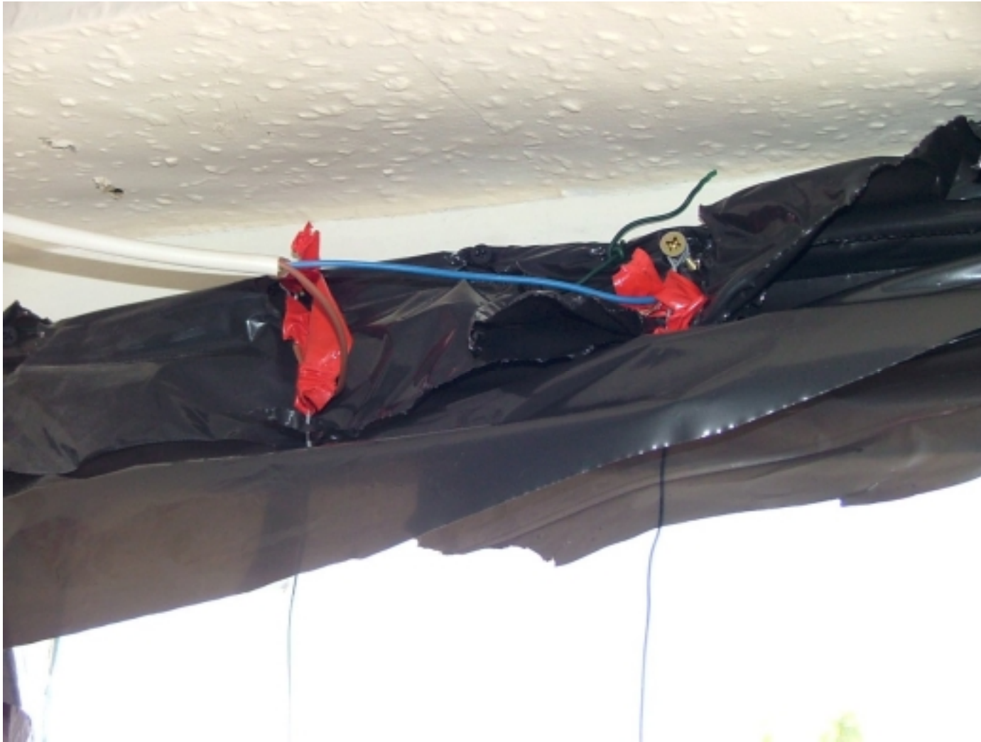
More window traps.